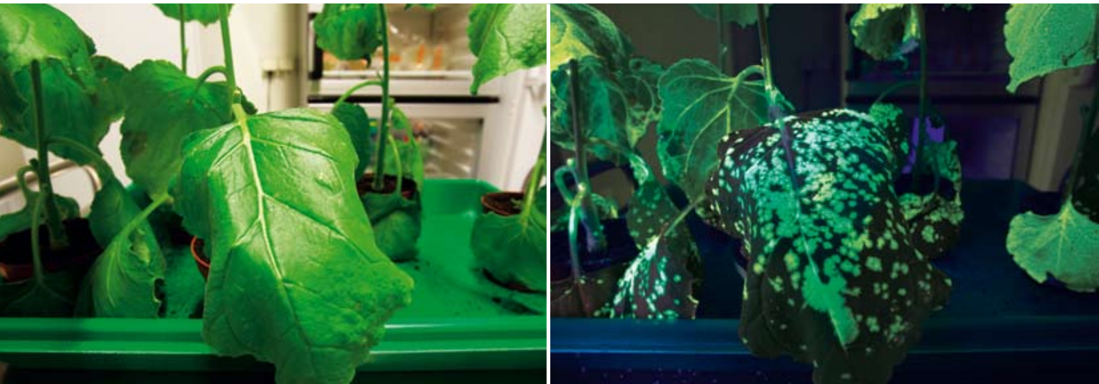
Tell-tale light: under ultraviolet light (right), the tobacco plants reveal that Bayer's scientists have successfully implanted the DNA for a luminescent protein into their leaves using the immersion bath procedure (see page 41). The green fluorescent protein (GFP) serves as a test for later active proteins. Using the immersion bath procedure, large quantities of proteins can be harvested very rapidly. After a while the tobacco plants lose the new gene.

production of pharmaceuticals. However, extreme sterility and very time-consuming, costly tests are needed to ensure that no pathogens such as viruses find their way into the cultures and replicate there. This is the only way in which to guarantee the safety of the products for humans.