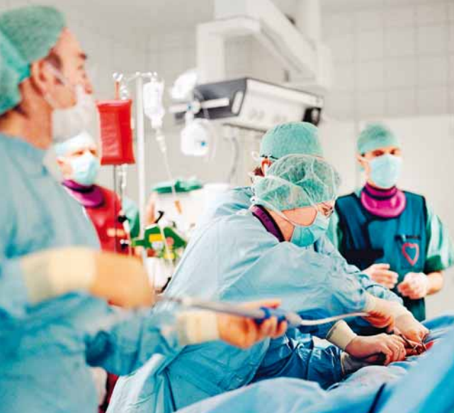
The long road to the heart: implanting an aortal stent – as here at Rostock University Hospital – requires plenty of sensitivity on the part of cardiologists.

high mechanical stability. This is the result of the stable chemical binding of the coating on the catheter: the Bayer scientists attach the coating molecules directly to the surface of the substrate. In addition they graft the slip improver – in the same way as individual branches when grafting trees – directly on to the medical device. "As we bind our material to the activated surface and coat it by dipping, there are no limits to the profiles of the parts which we can treat in this way," explains Koppenborg. Another unique feature is the fact that interiors – known as lumens – can also be coated with the innovative material. This is because the new material hardens purely thermally, drying by itself. Many of the materials which are normally used need UV irradiation for this, which does not penetrate inside.